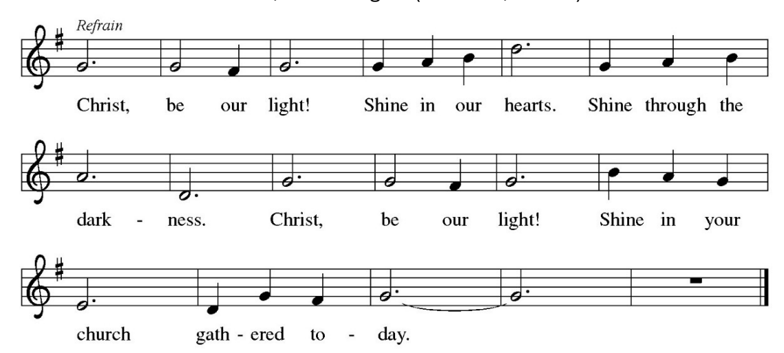
"Christ, Be Our Light" (ELW 715, refrain)

SONG FOR PRAYERS OF INTERCESSION (sing once before and after prayers)